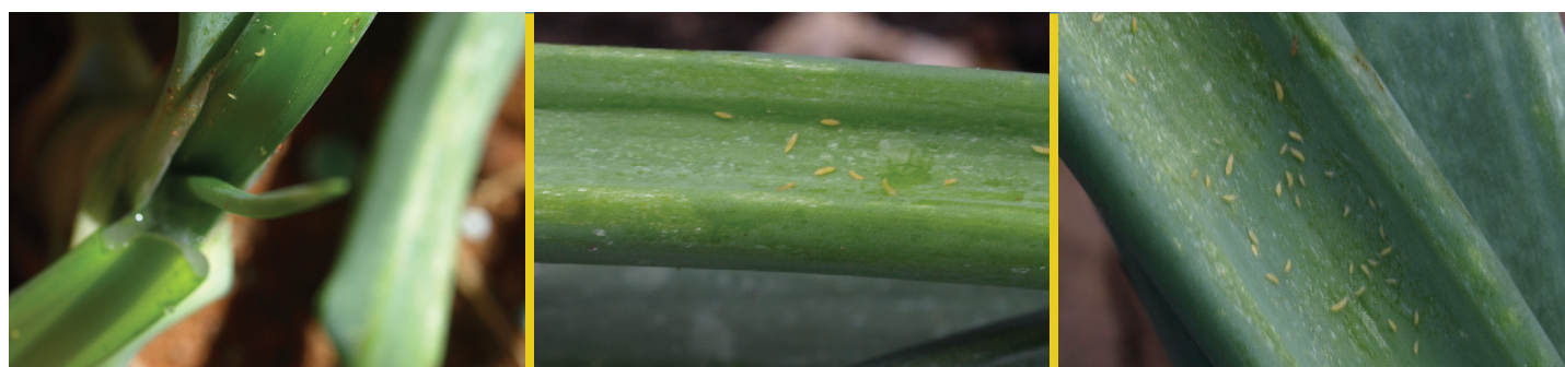
Juvenile onion thrips ( Thrips tabaci )

Movento plus adjuvant has shown good crop safety at a range of growth stages from 1st leaf to near mature plants.