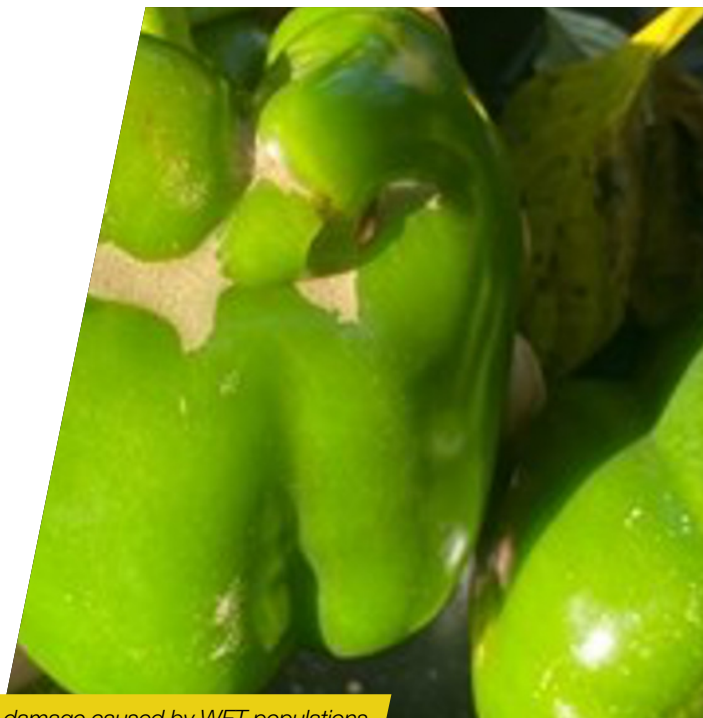
Fruit damage caused by WFT populations